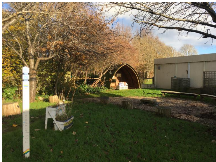
the spirituality garden