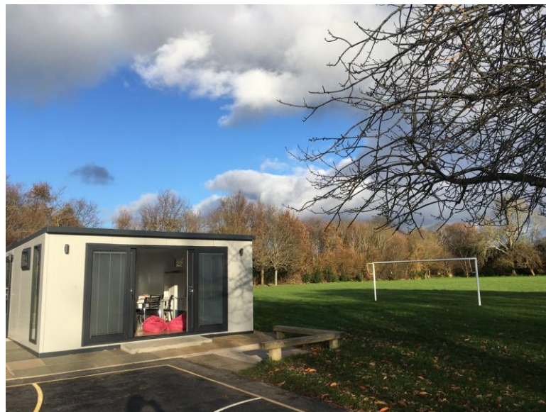
the reading pod

We are most fortunate to have a spacious and modern site. External facilities include a heated open-air swimming pool, a large grass sports field, a playground, a play area with exercise equipment and a reading pod enjoyed by children during breaks and used by staff for small meetings and specialist interventions. We also have an established Forest School set-up in the wooded area around the edge of the field, a spirituality garden and a standalone classroom providing space for specialist interventions and larger meetings which is also used by various school clubs.